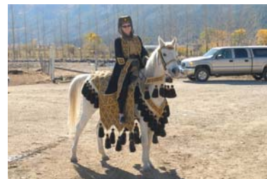
PUMPKIN ROLL COSTUME CLASS AT FTM....WHAT A FUN ONE!